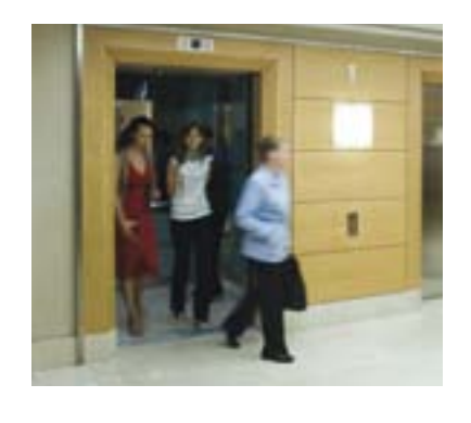
KONE handover services ensure smooth people flow in the building already on day one.

KONE personnel meet with the builder's representatives to go through the documentation and practices that will help keep the equipment in perfect condition. Once the equipment has been installed, the KONE ride quality experts evaluate the performance, ensuring that all requirements have been met.