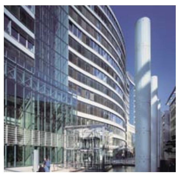
Frankfurter Welle, Frankfurt Total elevators: 36, of which 7 KONE CTU elevators were used during construction.