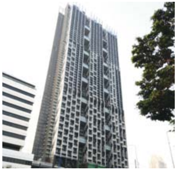
The MET, Bangkok, Thailand Total elevators: 23, of which 3 KONE JumpLifts and 2 KONE CTU elevators were used during construction.

KONE construction time solutions have been proven in hundreds of projects worldwide. KONE invented the JumpLift, and we have a proven track record with it on projects worldwide. Over the years KONE has continued to improve its CTU products, making them faster, more reliable, and able to serve higher buildings.