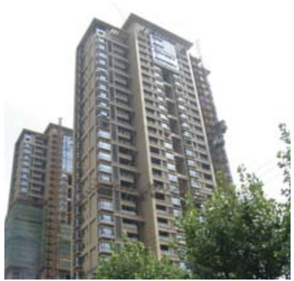
Rui Hong Xin Cheng project, Shanghai Total elevators: 4. 4 KONE JumpLifts were used during construction.