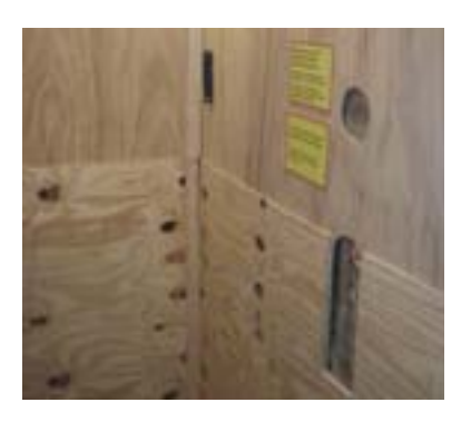
KONE CTU elevators are quickly converted into the building's permanent elevators.

After completion of the project, KONE CTU elevators are quickly converted into the building's permanent elevators. Protective materials are removed and the final signalization, interiors and landing materials are installed. With the KONE JumpLift, changing to the permanent elevator is a straightforward matter of installing the final machinery and finishing the surfaces of the car, doors and signalization.